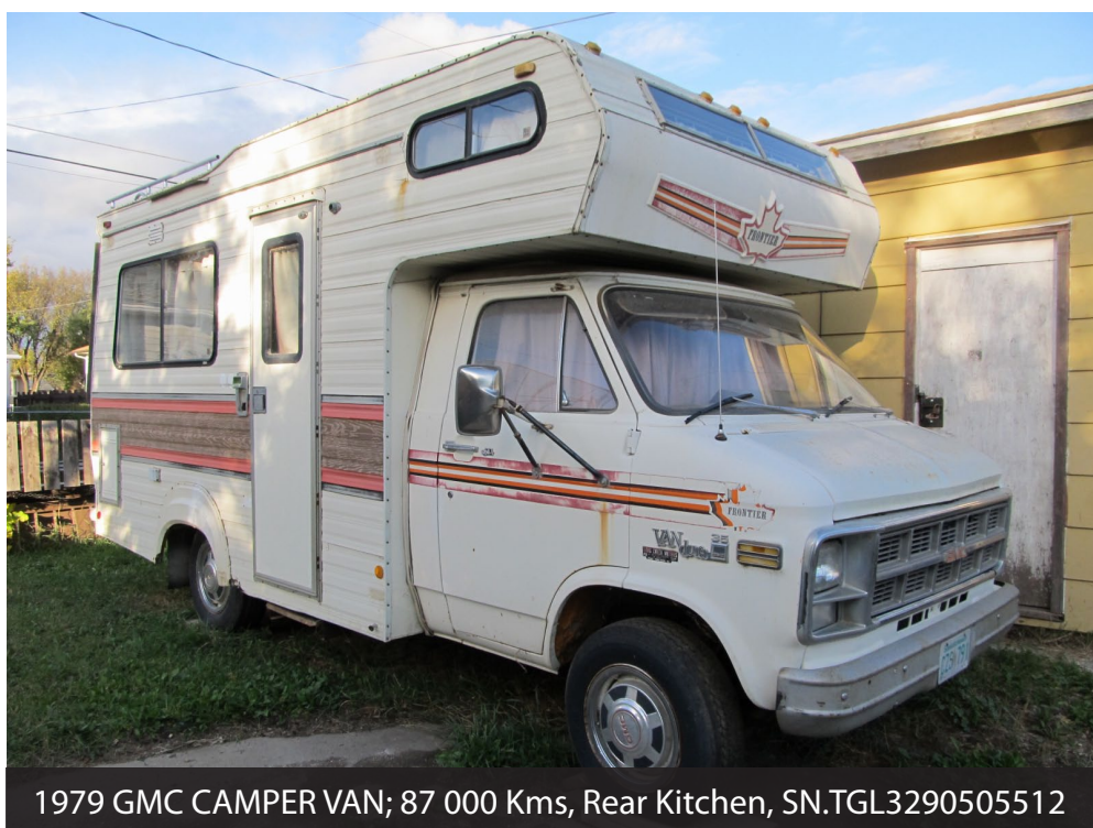
1979 GMC CAMPER VAN; 87 000 Kms, Rear Kitchen, SN.TGL3290505512