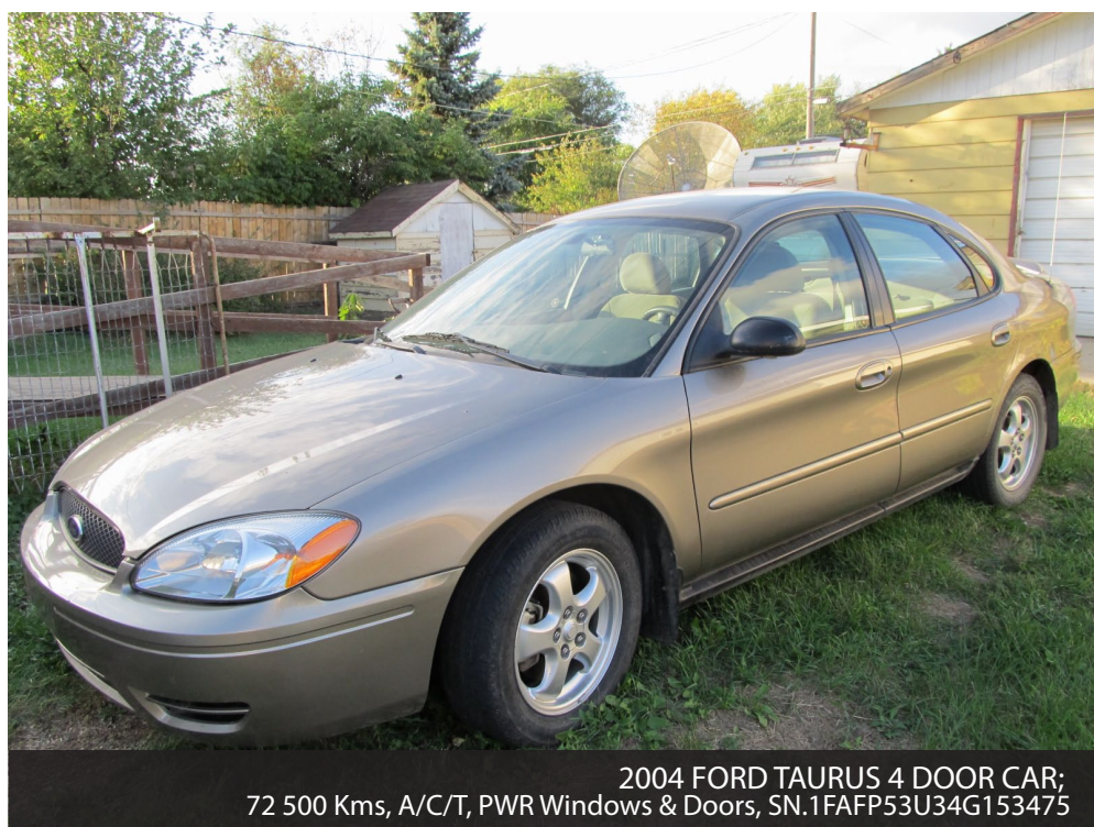
2004 FORD TAURUS 4 DOOR CAR; 72 500 Kms, A/C/T, PWR Windows & Doors, SN.1FAFP53U34G153475